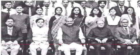
Lok Sabha Speaker Shri Om Birla inaugurated Appreciation Course in Parliamentary Practices and Procedures for Officer Trainees of Indian Police Service (IPS)...